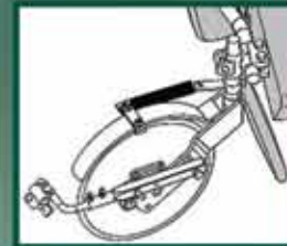
Optional Spring Pull is available for clearance or interference issues

When the Hawkins PLANTER "N" FORCER is used with a pump capable of 20 lbs or more of pressure your fertilizer can be placed accurately to the depth set by the single 14 inch double bevel blade. The PLANTER "N" FORCER is equipped with a down stop so if you hit soft ground it will not plunge no matter how much pressure is set on the adjustable spring relief. Terraced ground creates no problems with the Castering action of the PLANTER "N" FORCER. Tests have shown that the precise placement of liquid fertilizer will dramatically increase yield.